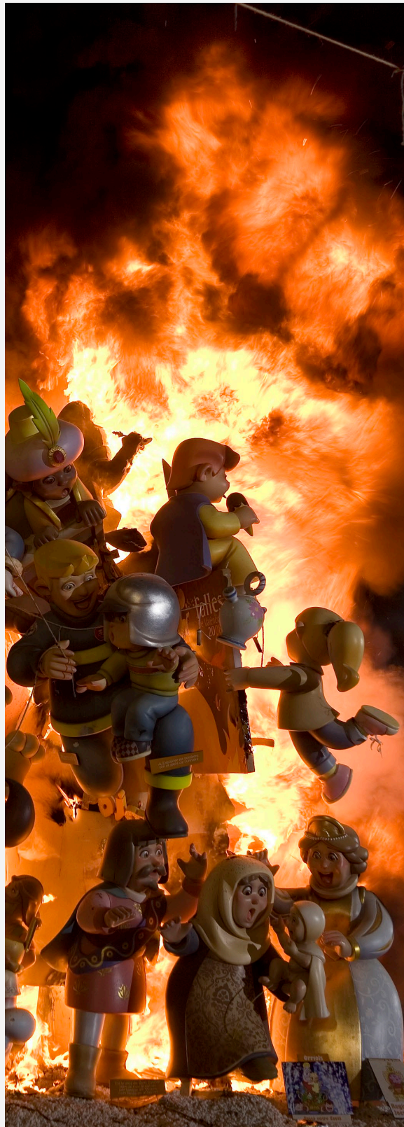
▲ LAS FALLAS BONFIRE FESTIVAL

Do you want to discover Valencian folklore? Don't miss the traditional dansà that takes place on the evening of the second Sunday in May as part of the festival of the Virgin of Los Desamparados , the patron saint of Valencia.