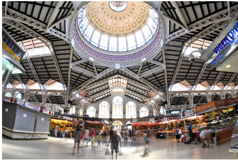
▲ CENTRAL MARKET

Enjoy one of Valencia's gems: the El Cabanyal neighbourhood. You will love strolling past its colourfully tiled house fronts, and visiting its fresh produce market.