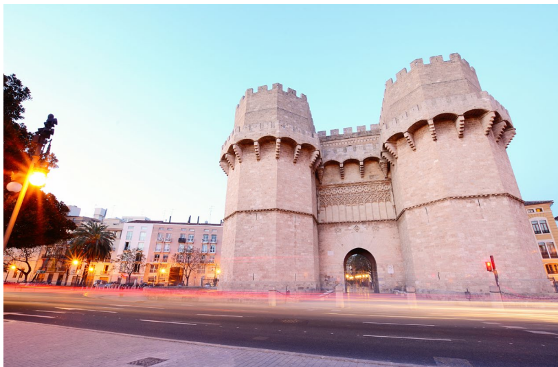
▲ SERRANO TOWERS