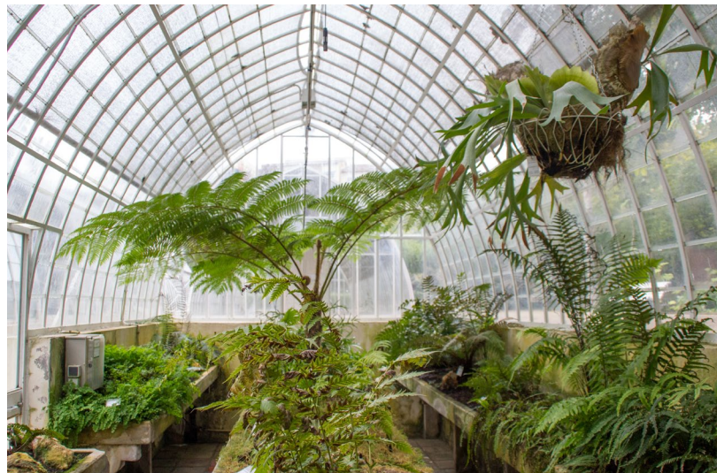
▲ BOTANICAL GARDENS