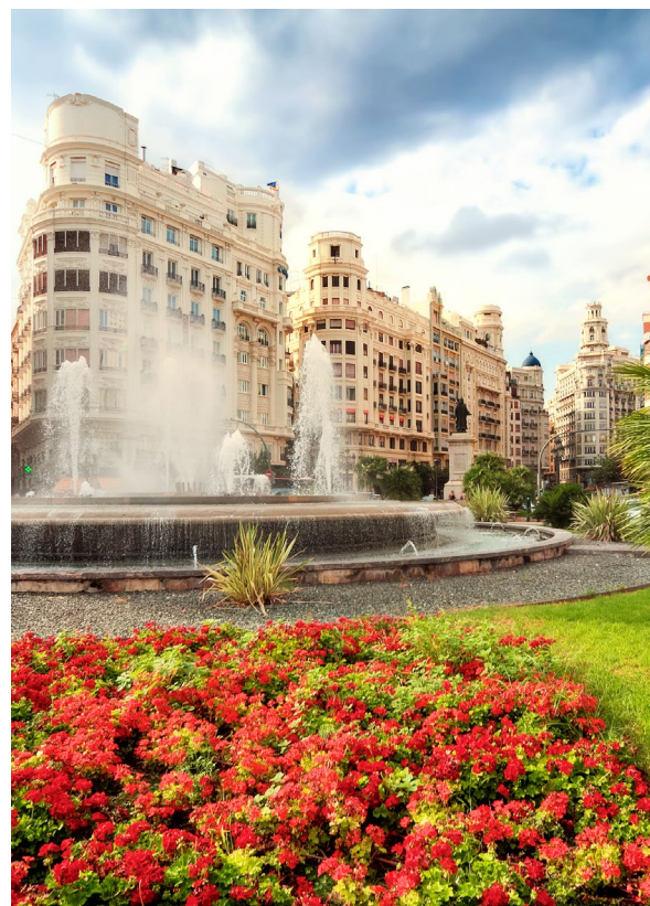
▲ PLAZA DEL AYUNTAMIENTO SQUARE

If you like crafts, try Plaza Redonda market, in the El Mercat neighbourhood, and come away with some souvenirs.