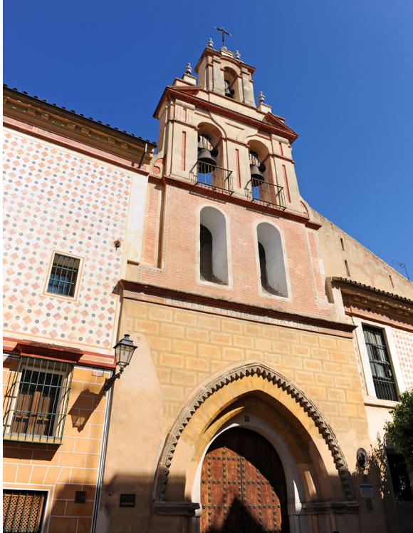
▲ CHURCH OF SANTA MARÍA LA BLANCA SEVILLE