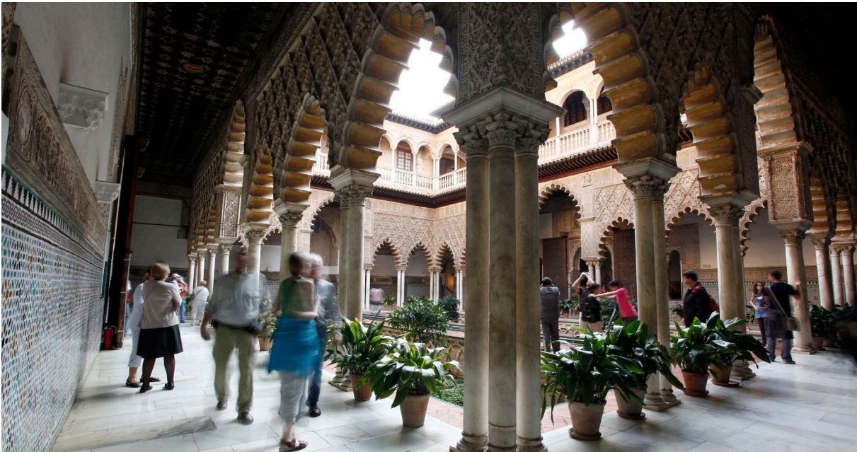
▲ REAL ALCÁZAR FORTRESS

Seville is distinguished by its fascinating neighbourhoods. These include Santa Cruz , right in the heart of the city, with its narrow streets, palaces and courtyards full of flowers; Triana , on the other side of the Guadalquivir River, with its seafaring flavour and flamenco art; and La Macarena , popular and full of history.