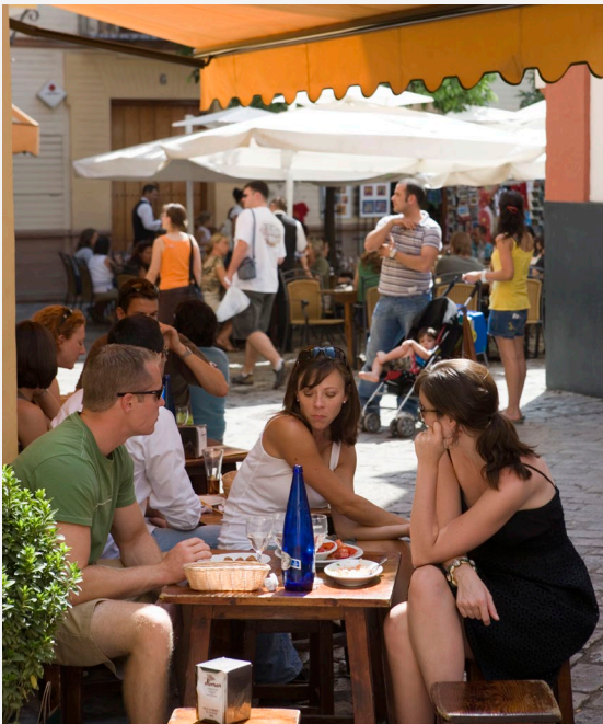
▲ SANTA CRUZ DISTRICT

It doesn't matter when you choose to visit Seville. The city has so much to offer that any season is good for tapas , live flamenco, a boat trip on the Guadalquivir River or the enchantment of Easter Week.