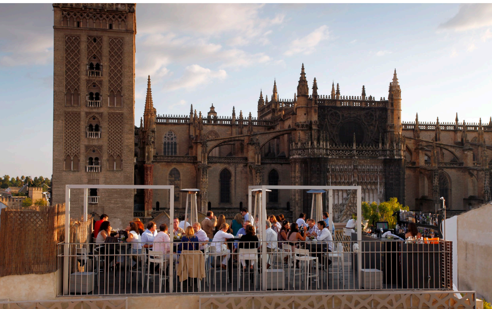
▼ TERRACE WITH VIEWS OF THE GIRALDA TOWER

Feast your eyes and your senses on one of the terraces with the best views of Seville. In the city's historic centre and the Triana district there are several establishments with attic terraces, offering the delicious Andalusian cuisine, shows and live music, with the sky of Seville as a backdrop. Enjoy the atmosphere, the unforgettable panoramic views of the city and wonderful sunsets over the Guadalquivir River.