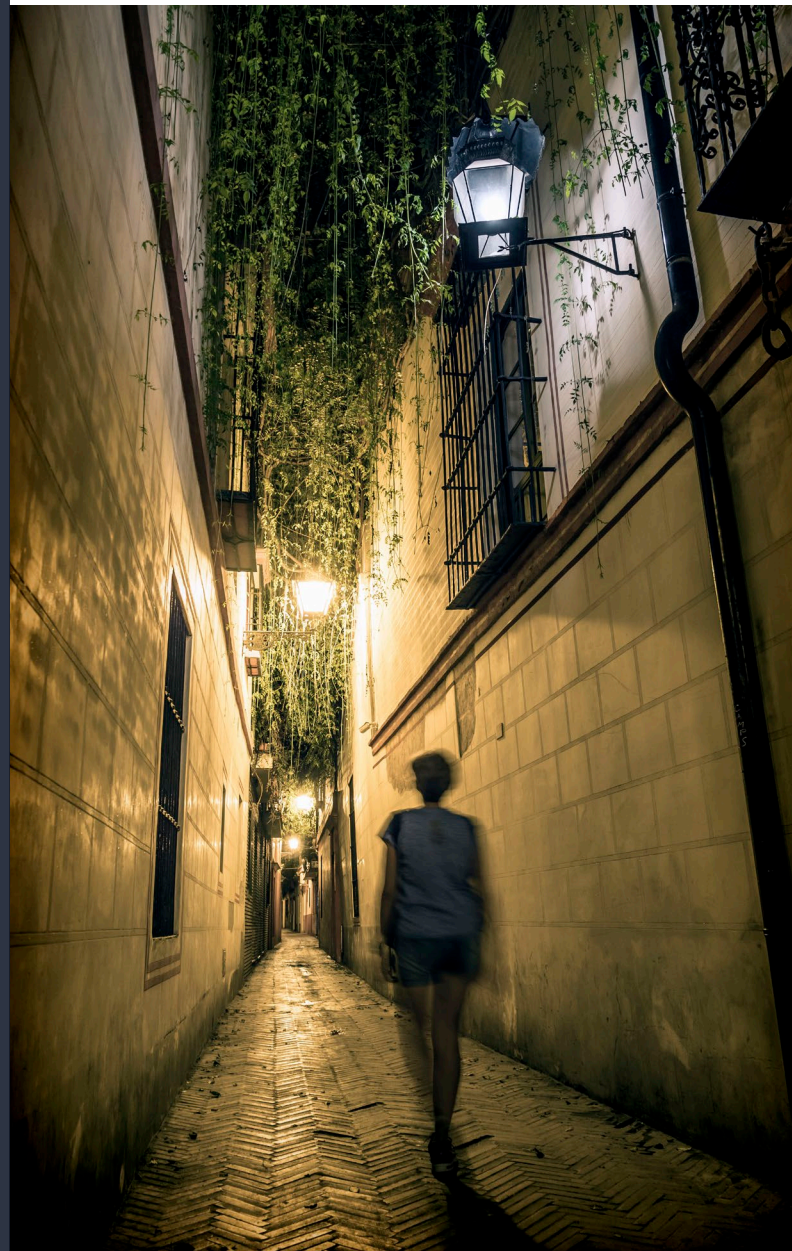
▲ SANTA CRUZ DISTRICT

Miguel de Mañara Palace is another monumental building, which, from 1623, served as the residence of aristocrats. Santa María la Blanca Church , built over an old 13th century synagogue, maintains its original structure, although it was rebuilt twice, first in the 13th century and later, in the 17th century, when it became one of the best examples of Baroque church architecture in Seville.