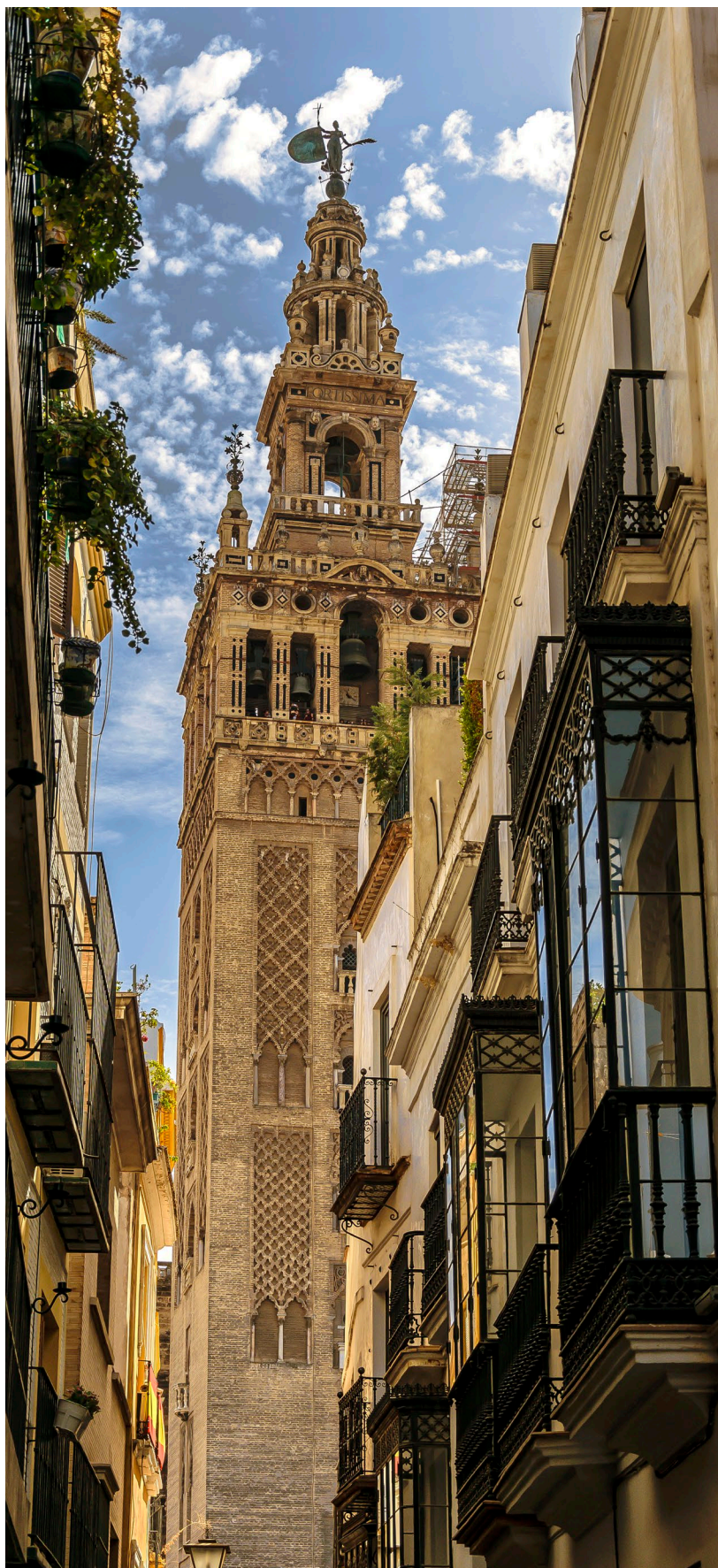
▲ THE GIRALDA TOWER

Get the taste of the city in the bars in its historic centre where you can try a great variety of delicious tapas . The heartbeat of Seville is in its streets. Take in its lively atmosphere in one of the pavement cafés with views and iconic monuments such as the cathedral and the Giralda tower .