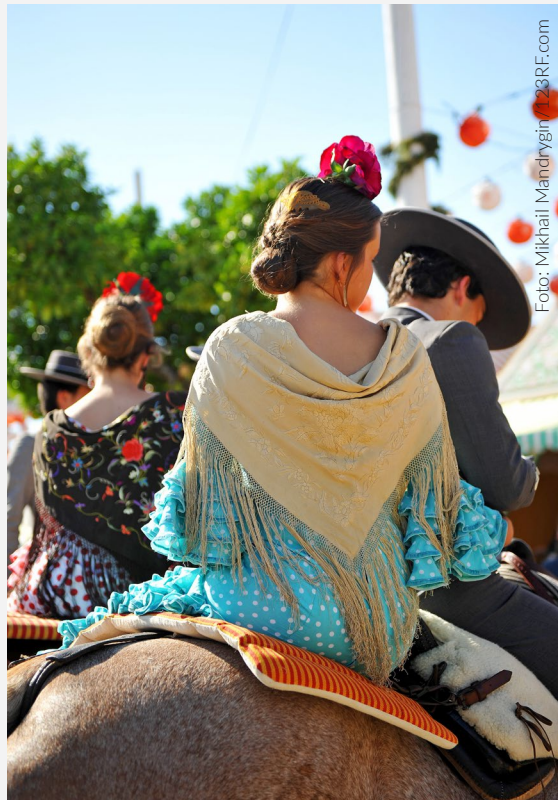
▲ FERIA DE ABRIL SEVILLA

The other great annual event is the April Fair . It is the fair to end all