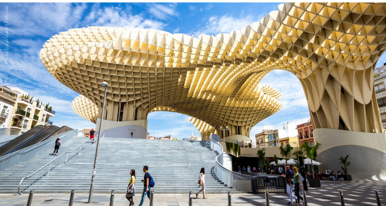
▼ METROPOL PARASOL

❶ For further information go to: www.museosdeandalucia.es www.setasdesevilla.com