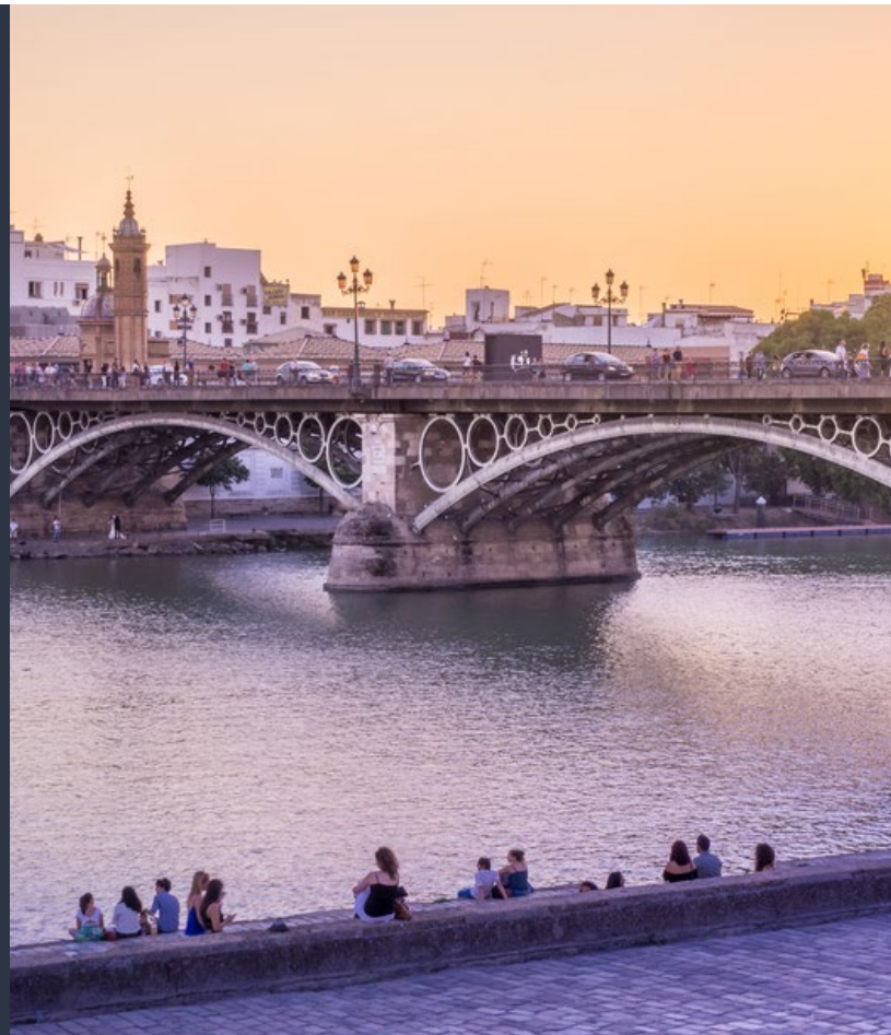
▲ ISABEL II BRIDGE

In Triana you will also find architectural marvels like the Callejón de la Inquisición (Alley of the Inquisition) , where remnants of the ancient San Jorge castle are preserved. In the Basilica of El Patrocinio you can admire the image of El Cachorro, an emblematic figure in Seville's Easter Week.