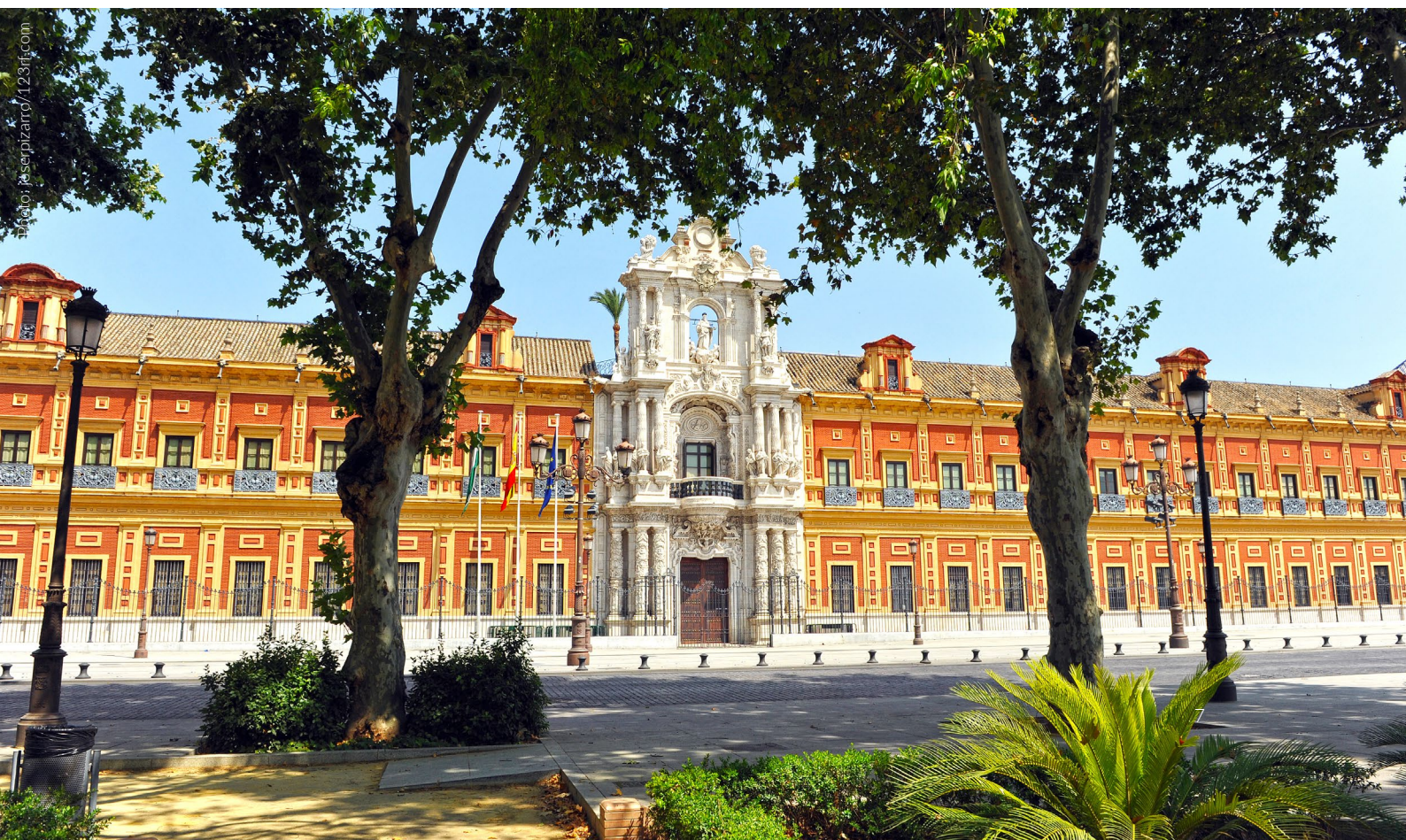
▼ SAN TELMO PALACE

Set aside a good bit of time to stroll down the tree-lined Alameda de Hércules boulevard, Seville's alternative space par excellence, with its spectacular mixture of historical spots, cultural offerings and nightlife. It has a great choice of bars and venues with live and electronic music.