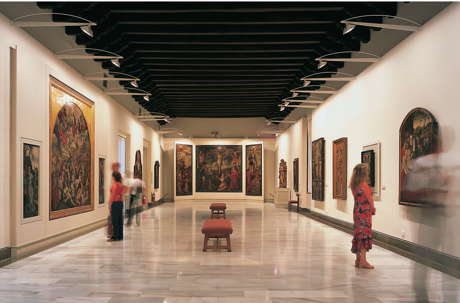
▲ MUSEUM OF FINE ARTS

Seville has been home to a great diversity of civilisations and artistic styles. Experience it all in the city's museums, theatres and cultural centres.