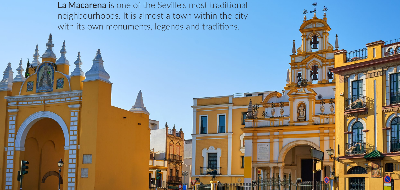
▲ ARCH AND BASILICA OF LA MACARENA

Located to the north of the historical centre, La Macarena is one of the Seville's most traditional neighbourhoods. It is almost a town within the city with its own monuments, legends and traditions.