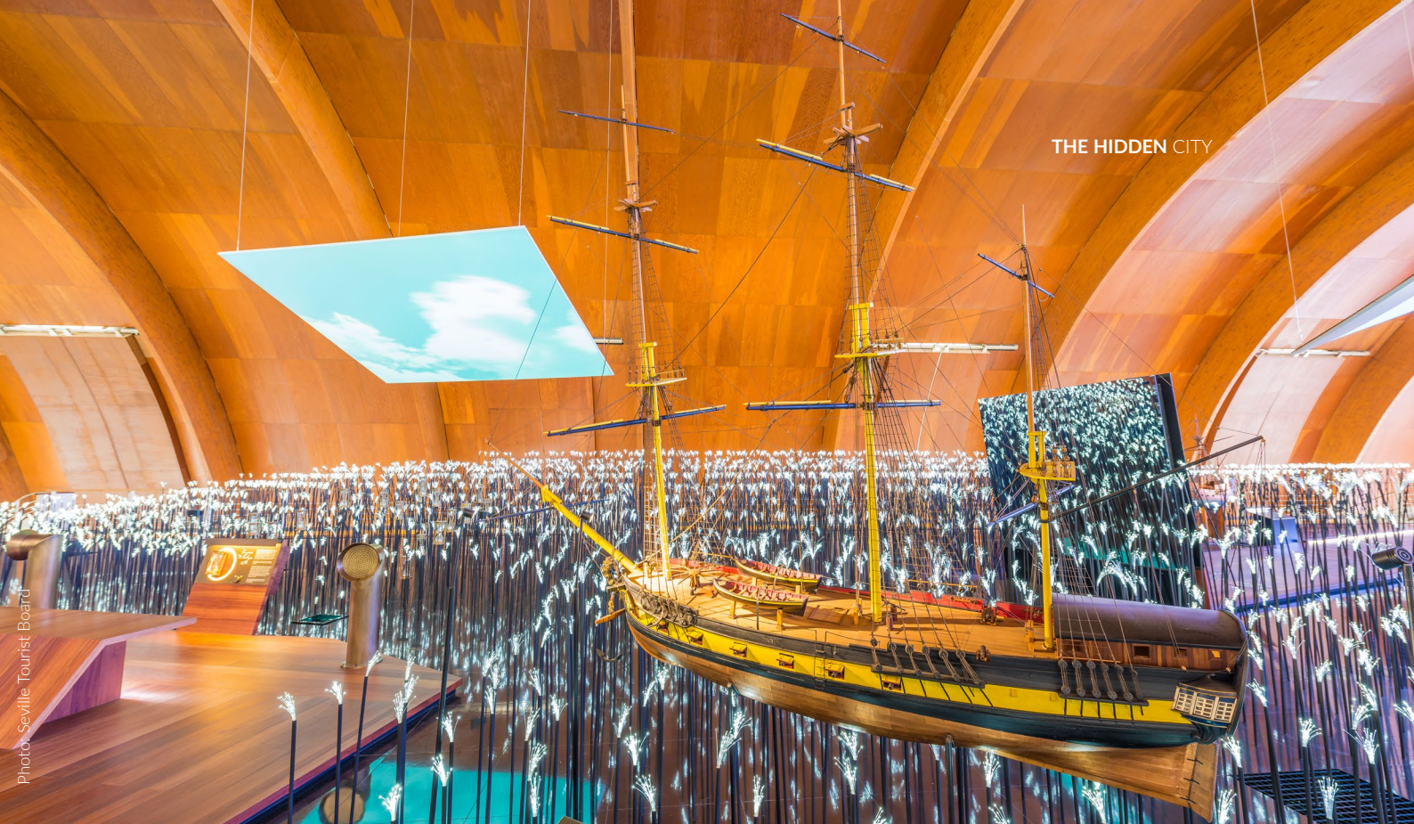
▲ NAVIGATION PAVILION