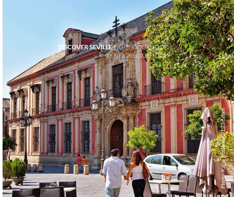
▲ ARCHBISHOP'S PALACE

Calle Sierpes is a must on your tour of the centre. This bustling pedestrianised street is very popular with people in Seville and is an ideal spot to enjoy a great selection of shops, bars and restaurants. This busy street will bring you